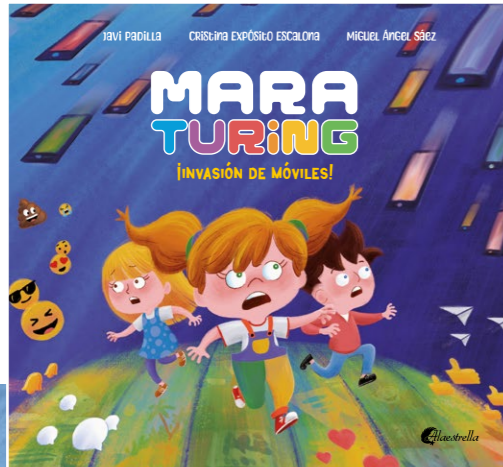
MARA TURING. #1. Editorial Alaestrella, 2025.